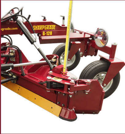
Rear blade to precision grade in reverse