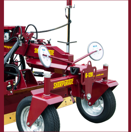
Telescopic retracting wheels for confined space / transport