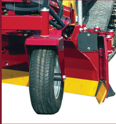
Hydraulic wings control material in both directions