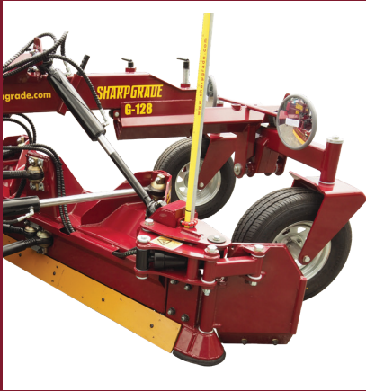
Rear blade to precision grade in reverse