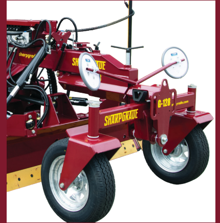
Telescopic retracting wheels for confined space / transport